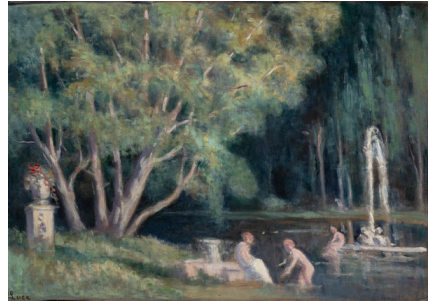
Maximilien Luce (French, 1858 - 1941) Around the Fountain , not dated Oil on canvas 26 3/4 x 34 3/4"