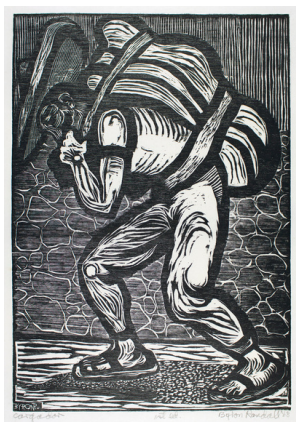
Cargador, 1968 Linocut on paper 26.5 x 20.5"