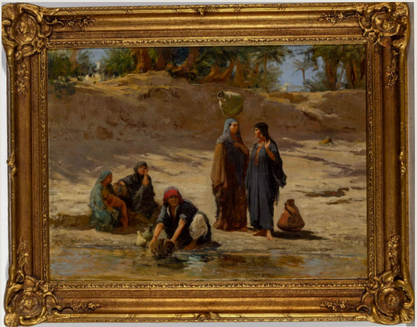
Frederic Arthur Bridgman (American, 1847 - 1928) Down by the River , not dated Oil on canvas 18 x 24 1/2"