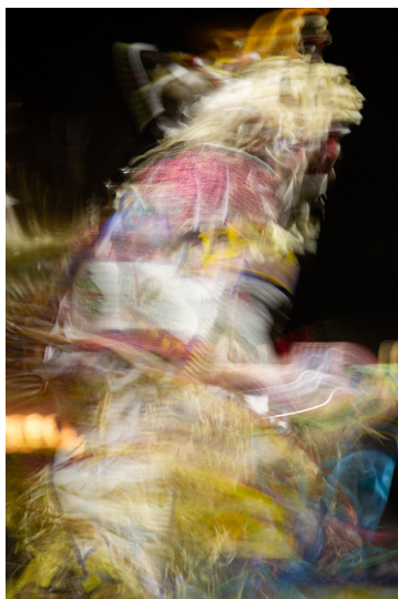
They Walk with Us Too , 2019

Purchased by the HMA with Elizabeth Fray Funds