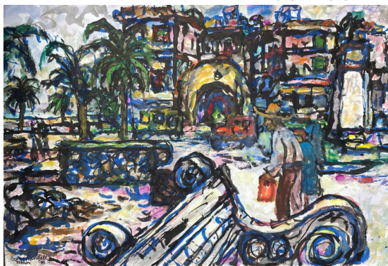
#5451, 1981 Watercolor on paper 15 x 22"