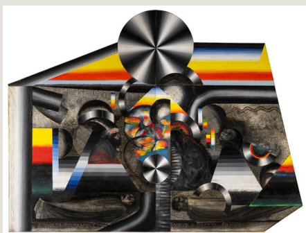
Nativity, 1970-77 Oil and charcoal with white lead base 9' x 12' Gift of Lisa Giobbi