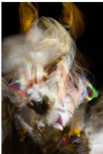
Majestic , 2019

Purchased by the HMA with Elizabeth Fray Funds