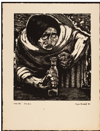
Coca Cola, 1955 Linocut on paper 16 x 12"